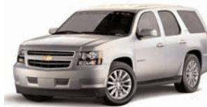
Sports Utility Vehicle